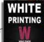
4" X 6" 3" X 5"