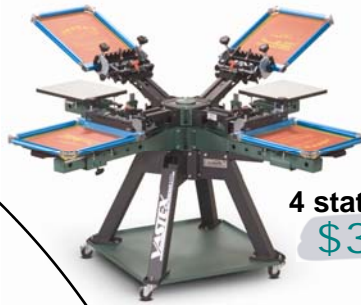
4 station, 4 color $3,692* V2HD-44