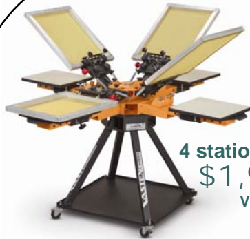
4 station, 4 color $1,953* V1-44

Premium HD Presses Available up to 10 color with 25 Year Warranty