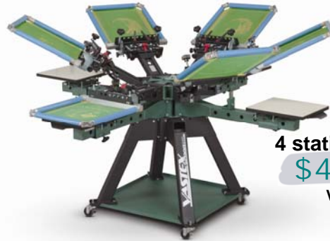
4 station, 6 color $4,614* V2HD-46