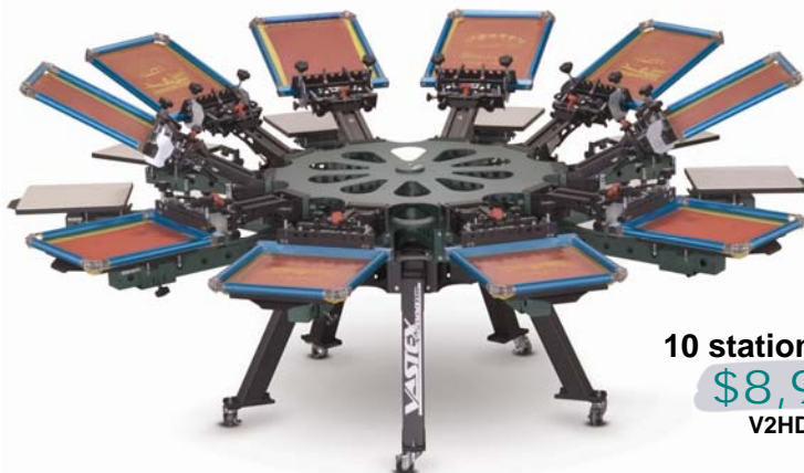
10 station, 10 color $8,929* V2HD-1010